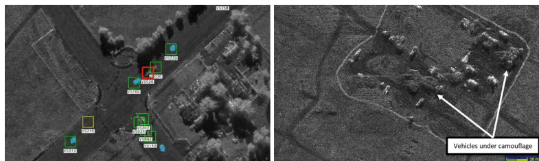
Moving Target Tracking