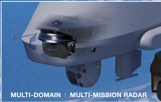
MULTI-DOMAIN | MULTI-MISSION RADAR